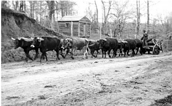
Figure 1: A team of oxen

What follows is a brief overview of the definitions and descriptions commonly applied to the terms team and teamwork in the literature: “Teamwork describes a gathering of individuals within a group who pool their expert knowledge and personal skills and agree to adhere to a set of specific rules in order to achieve a common objective. In such situations, the team is usually a part of a larger organization with a commitment to the former’s objective and overall goal” (Stahmer, 1996, p. 621).