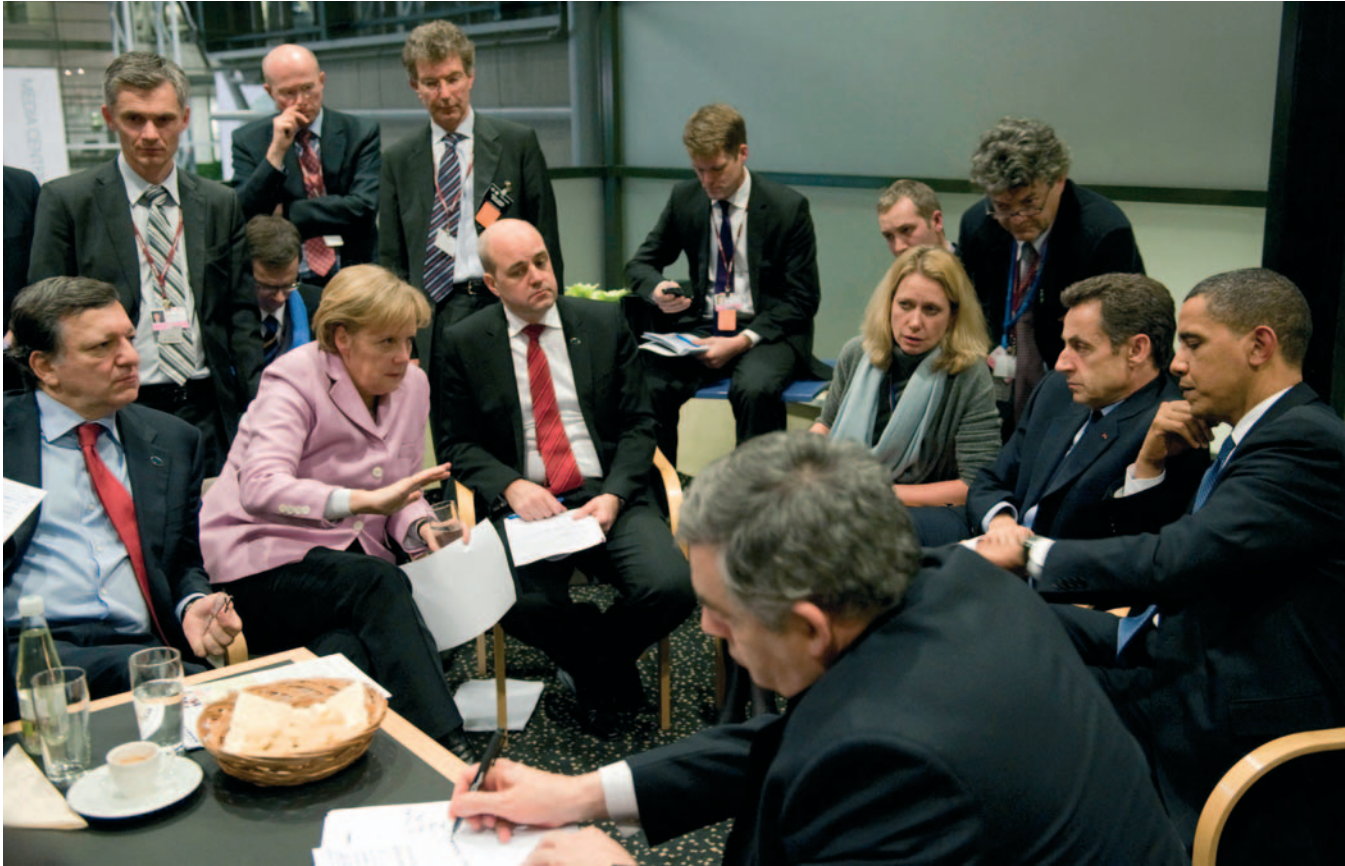
That is the way politics is done today: The heads of the world's wealthiest nations gathering at the UN Climate Change Conference 2009 in Copenhagen, Denmark. Regrettably, no consolidated resolution was reached.